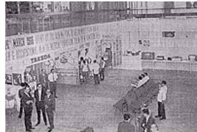
Pictures taken at the first Singapore Medical Convention, 23rd March 1968 at the Singapore Conference Hall. Occupational Health was one of the convention's themes