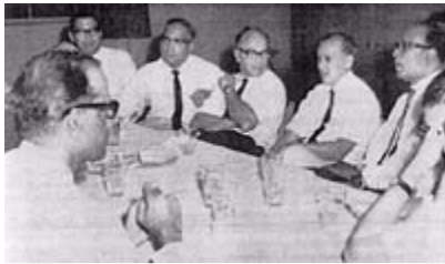
26th Sep 1967, SOM hosted luncheon for visiting team of Occupational Health experts from WHO