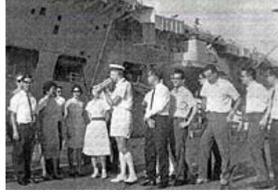
29th June 1968, SOM tour of the naval base dockyard.