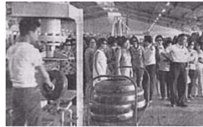
14th Oct 1967, SOM tour of Jurong Industrial Estate. Pictures at Bridgestone tyre factory