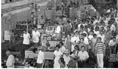
29th June 1968, SOM tour of the naval base dockyard. General view of the engineering workshop