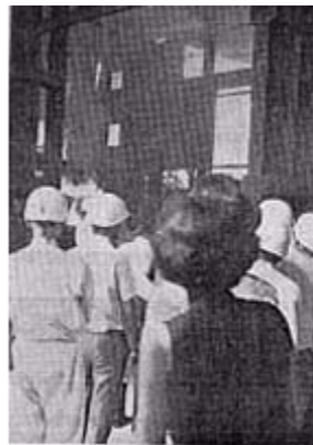
14th Oct 1967, SOM tour of Jurong Industrial Estate. Pictures at National Iron & Steel Mills